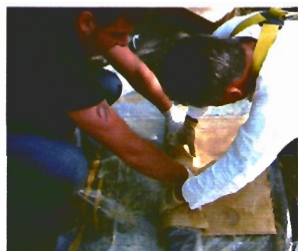
Wrap patch around packer