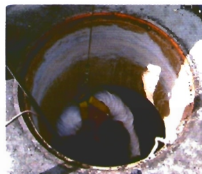
Push packer into sewer line