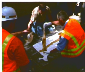
Prepare resin and patch